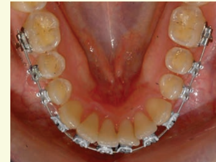
Spaces created between the back teeth