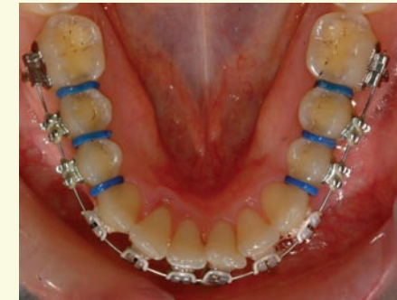
Elastic separators between back teeth

Sometimes, to make some temporary space between teeth beforehand, small rubber rings called separators are placed between the teeth, a week before the interproximal reduction procedure is carried out, in order to move the teeth apart slightly.