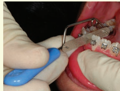
Enamel reduction by hand using an abrasive strip (file)