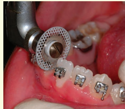
Enamel reduction by rotating disc