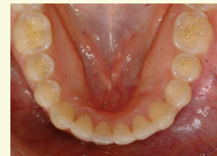
Spaces closed by fixed braces and front teeth straight