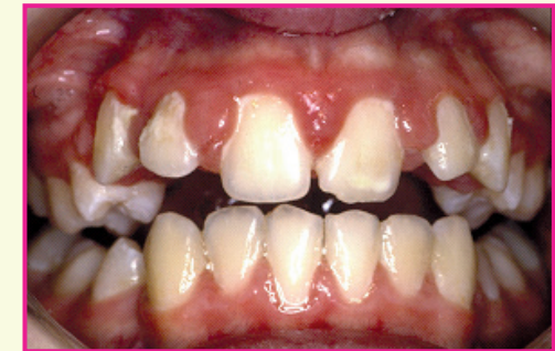
Damage caused by the brace due to sugary snacks/drinks and poor brushing.

Sugary snacks/drinks and poor cleaning of your teeth and brace will lead to permanent damage to your teeth as shown in the picture below.