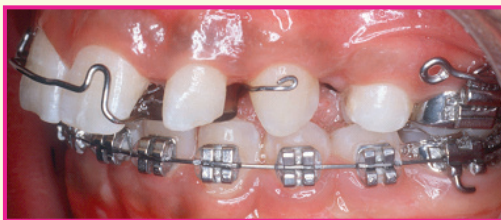
A removable brace on the top teeth and a fixed brace on the bottom teeth.

Your speech will be different at first. Practice speaking with the brace in place e.g. read out aloud at home on your own. In this way, your speech will return to normal within a couple of days. To begin with you may produce more saliva and have to swallow more than normal. This is quite normal and will quickly pass in a couple of days.